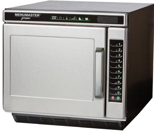
Model JET514V shown